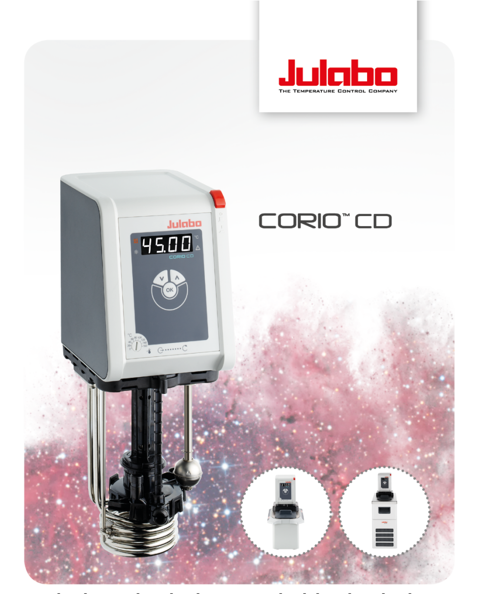
Heating immersion circulator, open bath heating circulator, refrigerated circulator